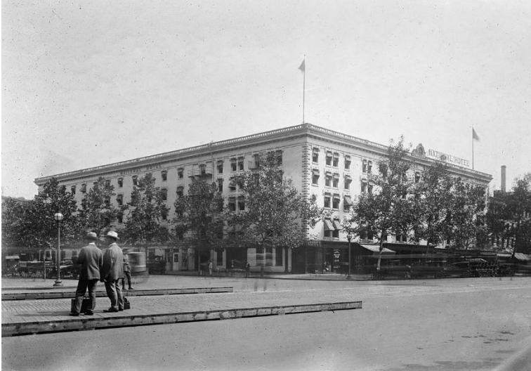
Fig. 2. National Hotel, Washington, D.C.