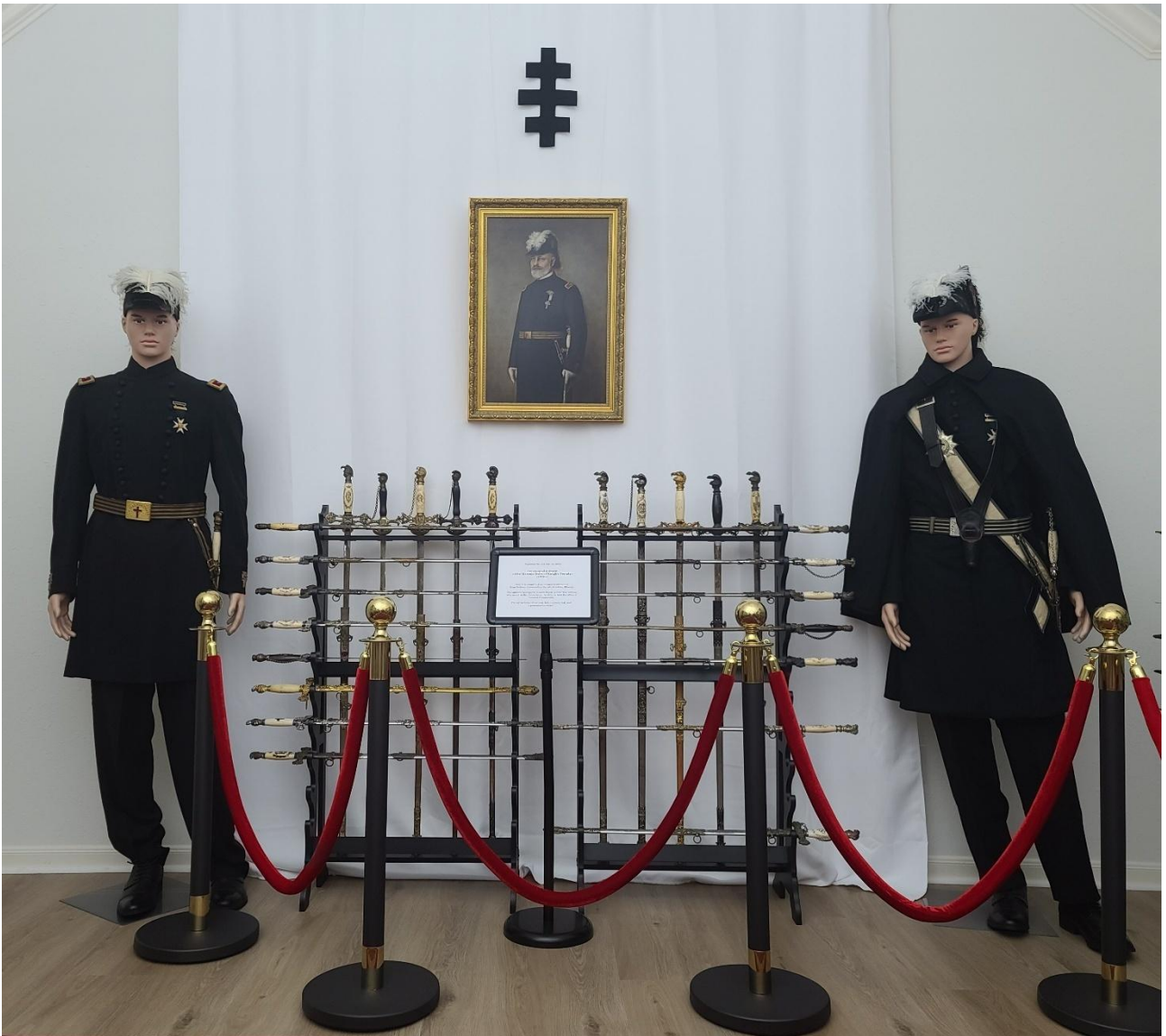
Fig. 1. The western side of the Museum of the History of the American Knights Templar.