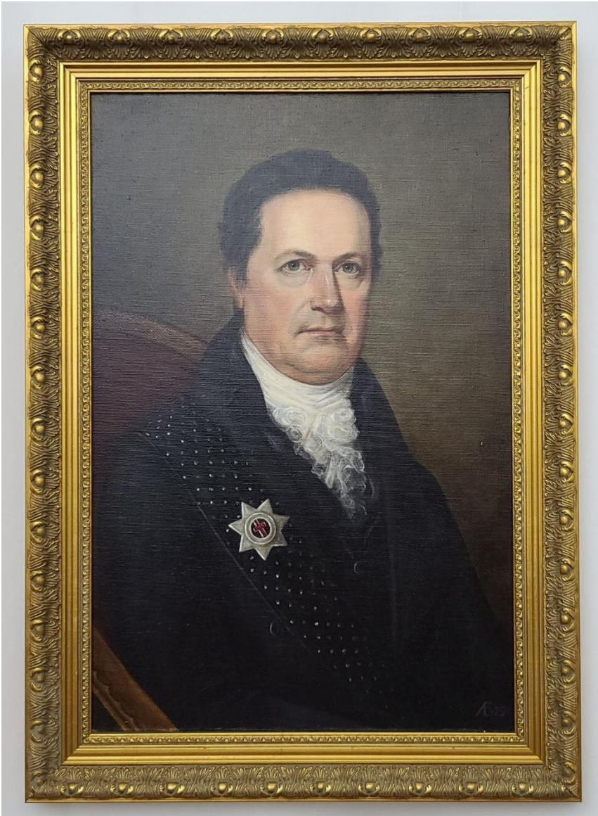
Fig. 1. Sir De Witt Clinton (1769–1828), 1st Grand Master of the Grand Encampment of Knights Templar in the United States. Oil Painting. By Art. Lyudmila N. Bogutskaya (1979 year of birth). 2025