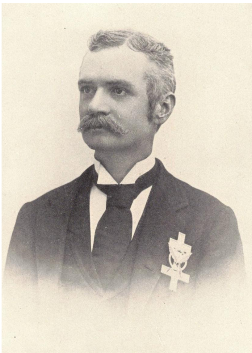
Fig. 1. Sir Knight William B. Isaacs.