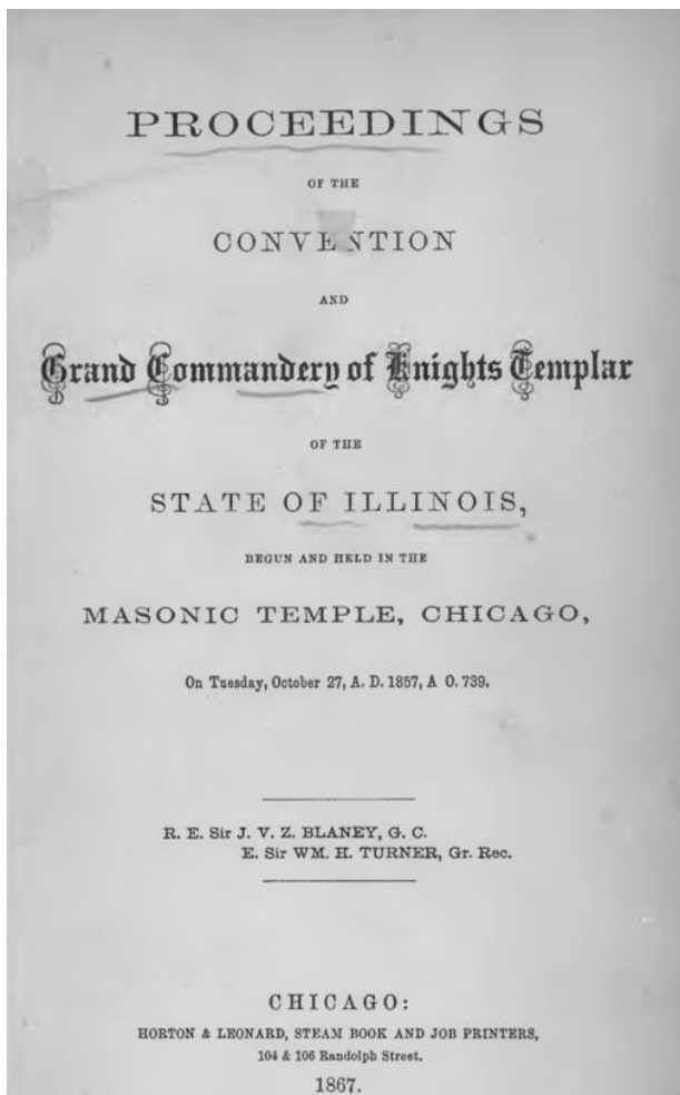
Fig. 1. The first collected volume of the annual conclaves of the Grand Commandery of Illinois. Chicago, 1867.

Ten years later, in 1867, the materials of the first eleven annual Annual Conclaves were published together in a single volume (Fig. 1). This volume consisted of 346 pages, while the materials of the most recent conclave alone already amounted to 70 page 3 .